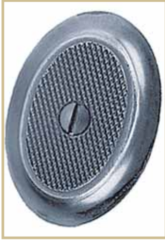
FIGURE 8—The Niedner Series 5 Grip Cap

At this point, since we're discussing the pistol grip, Ron decides on a checkered steel pistol grip cap. Specifically, he selects a Niedner cap (Figure 8). (These caps are available from several sources, such as Brownells, Midway USA, and Dakota Arms.) So far, we've determined two major factors of the stock design: length of pull and grip cap dimension and shape.