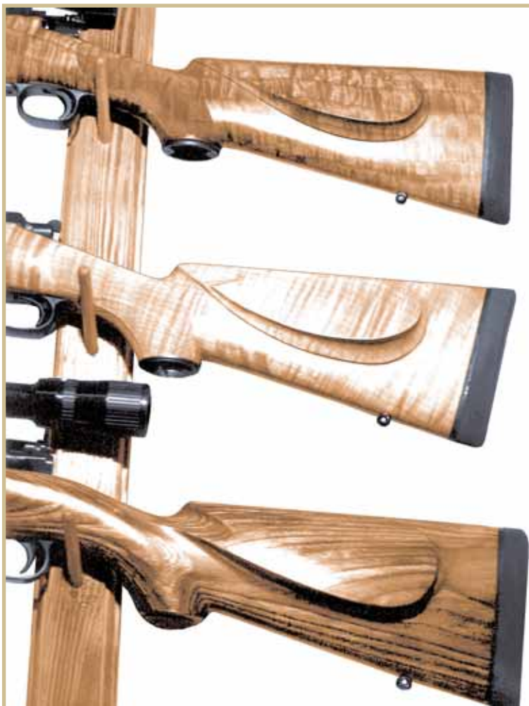
FIGURE 4 —Shown are three different cheekpiece styles on classic-style stocks. The top stock is Bostogne walnut, the middle stock is maple, and the lower stock is laminated birch.

Simple elegance typifies the classic stock . The style is called classic because it has endured and because it has a no-frills design. Straight combs prevail in this stock style without excessive drop at the butt or point of comb. Its cheekpiece is rather simple in nature, usually trailing out and tastefully disappearing into the top of the wrist (Figure 4). To accentuate the cheekpiece with a touch of class, a shadow line may be used to subtly enhance the lines.