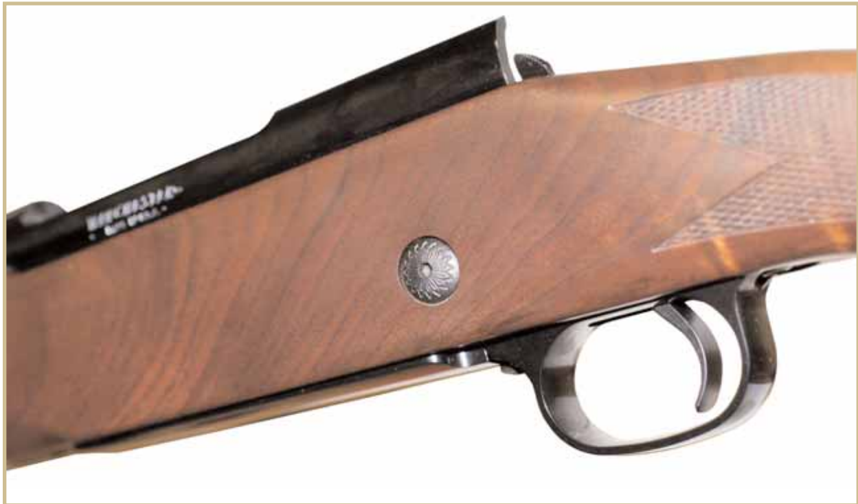
FIGURE 11—A crossbolt on a Winchester Model 70 provides extra strength to the stock on a hard recoiling rifle.

The big bore trend. There's a decided trend toward the custom big bore rifle, especially .416s (as well as .375s and .458s). Big bore rifles have hard-recoiling calibers. So, the gun maker must reinforce around the recoil lug, add additional recoil lugs on the barrel where called for, and add cross-bolts in back of the recoil lug that go through the stock for added strength (Figure 11).