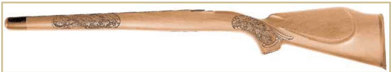
FIGURE 1 —Notice the attractive oak-leaf pattern on this Bishop-III stock.

A gunsmith requires a basic understanding of stock function prior to becoming a stock maker. A rifle stock, in function, is nothing more than a segment of wood, fiberglass, plastic, or other material shaped to support the rifle's barrel and action. It also functions to conform to the shooter's body so the shooter can control the firearm. That's the mechanical side of it. However, arms lovers the world over consider a stock much more than a mechanical device. They think of a gun stock as a work of art and function (Figure 1). As a prospective gunsmith, we hope this is your position.