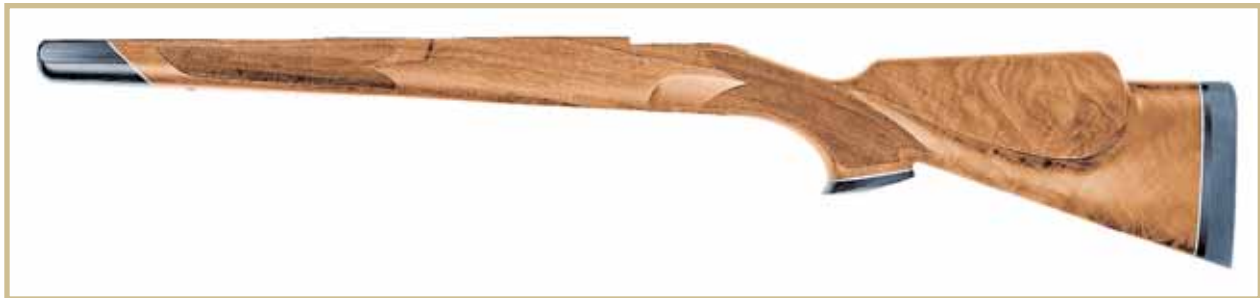
FIGURE 9—A Monte Carlo with a Rollover Cheekpiece