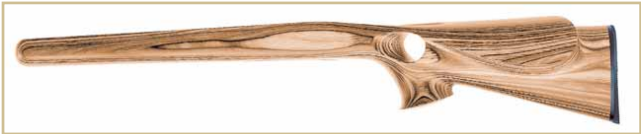
FIGURE 6—A Thumbhole Sporter Stock

There are few guidelines to mark the thumbhole-style stock from other stocks, aside from the fact that the thumb of the shooter extends through the pistol grip itself rather than wrapping around it. Also, most thumbhole stocks have very little drop at the comb. Harry Lawson of Tucson, Arizona, has done more with thumbhole stocks than any other well-known gun maker of the era. His designs are radical, dealing heavily in contrasting woods for forearm caps and pistol grip caps and often carrying considerable embellishments, including inlays. The thumbhole-style contemporary stock isn't for everyone, but the style has a strong following.