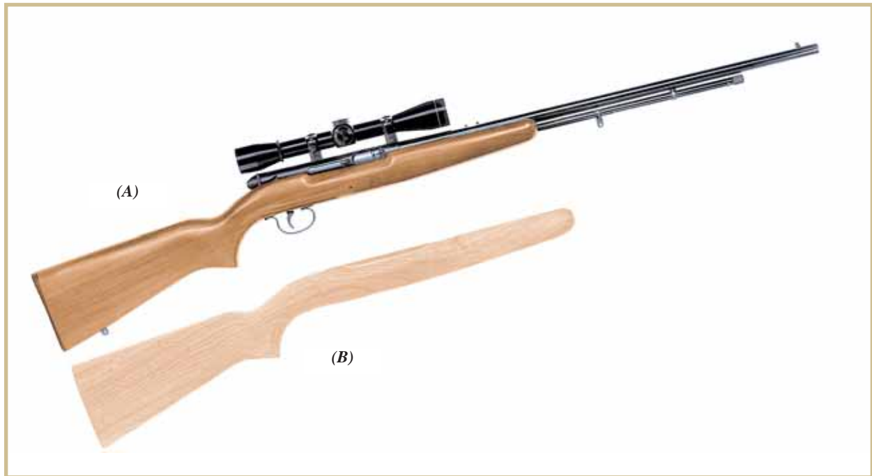
FIGURE 3 —Shown in (B) is the semi-inletted stock for the Remington 500, shown in (A).

models. They're available in different styles, with various dimensions as well. Each company strives to individualize its product line so that we can clearly recognize its stocks.