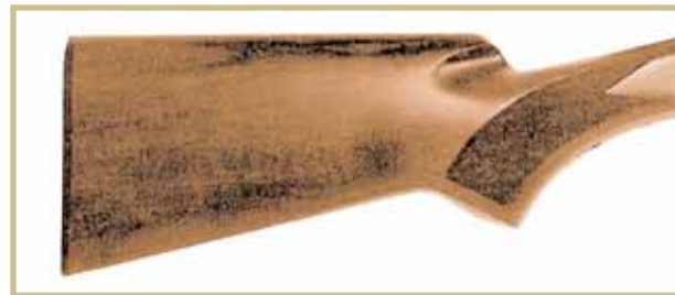
FIGURE 5—Shown here is a standard grade stock made from English walnut.

It's common to find a classic-style custom stock adorned with a horn or checkered steel buttplate, or a skeleton buttplate with a steel border around the butt with the center of the plate left open to expose wood for checkering. Such buttplates are for show, not durability or function.