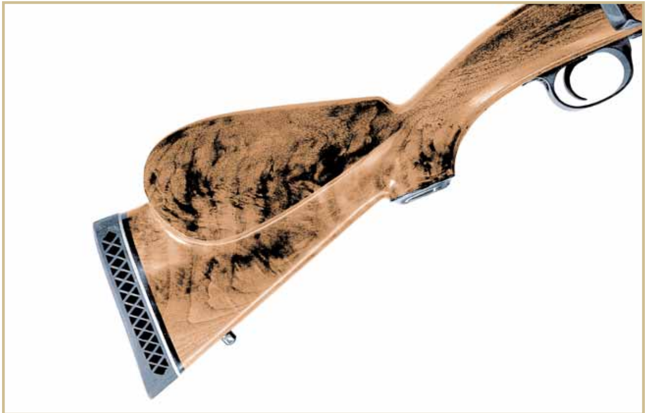
FIGURE 7 —Shown is an elaborate rollover cheekpiece patterned after the Mannlicher rifle.

In many regards, the rollover-style cheekpiece is a spin-off of the Monte Carlo (Figure 7). Where we normally see the prominent rise at the buttstock on the Monte Carlo design, all we see on the rollover style is the rollover itself. This style is evident on a number of rifles, including the famous Mannlicher.