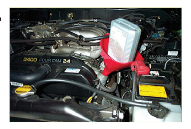
FIGURE 17—Oil-Filling Funnel

Start the engine and observe the oil pressure warning light. It should go out within a few seconds once the engine is running. If the light doesn't go out, shut the engine down immediately and tell your supervisor or instructor. If the light goes out, shut off the engine and recheck the engine oil level. Some of the oil goes in the filter, and the level may drop slightly. The level with a full filter should be at the full mark or slightly below the mark. Top off as needed.