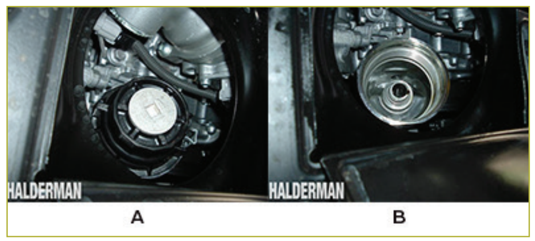
FIGURE 11—Cartridge Oil Filter with Top (A) and Without (B)