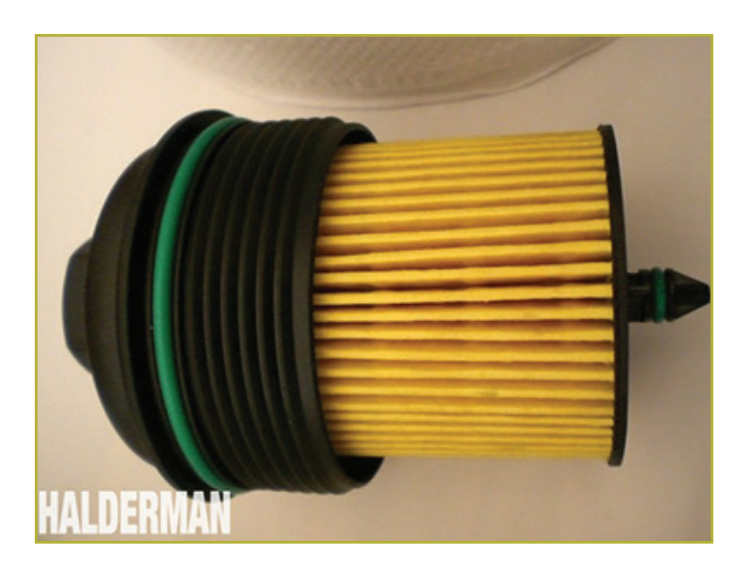
FIGURE 16—New O-Ring on a Filter Cartridge

Use a large-mouth clean funnel to prevent oil from dripping on the engine (Figure 17). Most quart containers are shaped to reduce the amount of spillage. Install the specified amount of engine oil and then reinstall the filler cap.