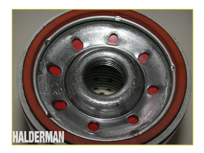
FIGURE 14— Spin-On Filter Gasket

Note: Many technicians fill the new filter with oil to speed up the lubrication process, as shown in Figure 15.