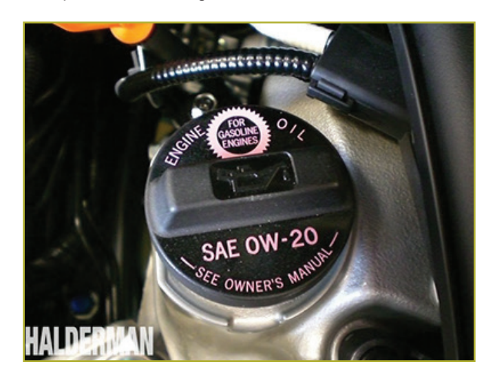
FIGURE 8—Oil-fill cap showing the correct oil viscosity for the engine being serviced.

Before starting an oil change, get the oil and filter. The type of oil is determined by the OEM specifications. Oil viscosity, or thickness and weight, is listed in the owner's manual, online service information, and on the oil-fill cap, as shown in Figure 8.