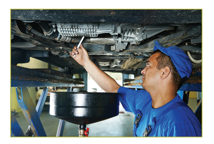
Check the drain plug for a gasket (Figure 13). Many plugs have a brass or plastic washer to help seal

the drain hole. Replace the gasket if one is used. When the oil is completely drained, install and torque the drain plug to OEM specifications. Never overtighten the plug because it's easily stripped. Locate the correct filter wrench. There are different wrenches available, and more than one may work. Filter location determines which wrench will be the best to use. If the filter is a spin-on type, position the drain pan under the filter and loosen it. If the filter is mounted horizontally, you can puncture the end with a scratch awl , which looks like an ice pick, and drain out the oil in the filter to prevent a mess. If a cartridge filter is used, loosen the cartridge housing cover nut (see Figure 11) and remove it; then remove the old cartridge. Most of the oil will be in the old cartridge, so there should be little drainage.