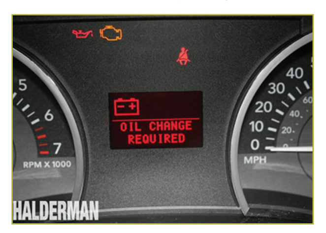
FIGURE 7—Oil-Change Indicator