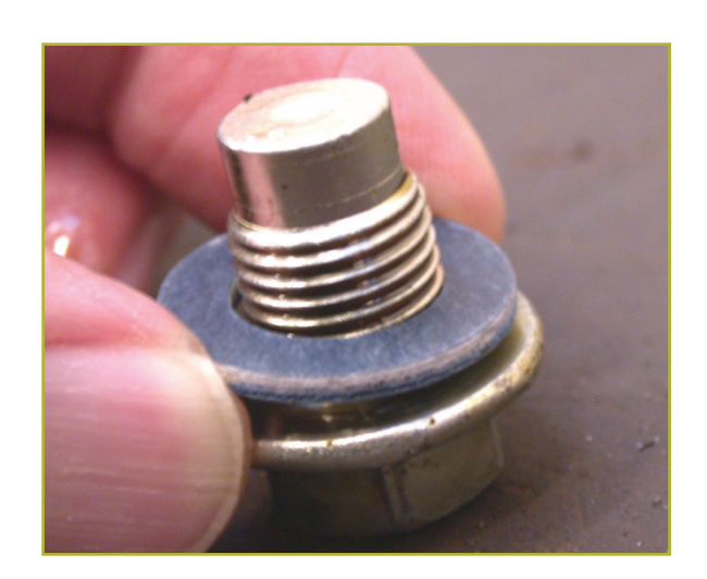
FIGURE 13—Drain Plug

While the spin-on filter is draining, open the oil and use a finger to smear a light coat of oil on the filter gasket of the new replacement filter. (Figure 14). This will help with future removal. Remove the old filter and inspect the end that fits against the mount.