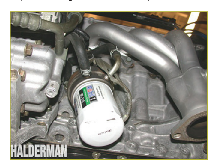
FIGURE 9—Spin-on Oil-Filter Canister

To begin an oil or filter change, move the vehicle to the oil-change bay or pit. Raise the hood and make a quick inspection to find the oil filter. Some filters are mounted on the front of the engine and removed from under the hood instead of from under the vehicle. Other spin-on filters, like the one shown in Figure 9, are removed from under the vehicle while it's on a lift. Still newer engines have returned to a cartridge filter (Figure 10). Figure 11A shows a cartridge filter with its top included. Figure 11B shows the top removed.