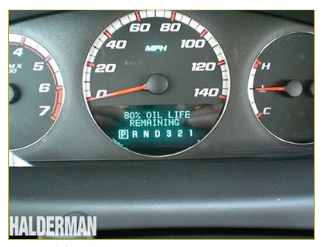
FIGURE 6—Oil-Life Monitor

Most OEMs recommend that the engine oil be replaced with a new filter every 7,500 miles (12,000 km) or every 6 to 12 months. Most vehicles made since the early 2000s use an oil-life monitor system to notify the driver when the engine oil should be changed (Figure 6). The oil-life monitor will light a dash lamp when the oil needs to be changed. It also indicates the amount of oil life left before the oil-change indicator is illuminated (Figure 7). Most OEMs recommend that the oil be changed according to a "normal" or "severe use" schedule. On GM vehicles with the OnStar system, the vehicle communicates oil life to the car dealership.