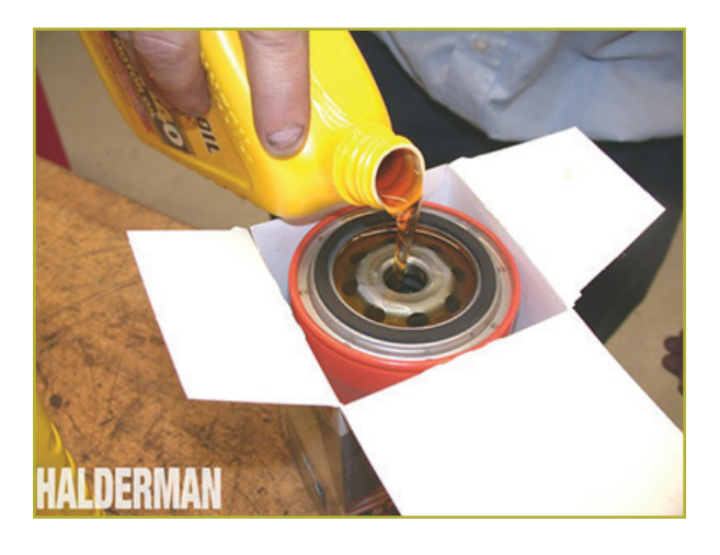
FIGURE 15—Filling the New Filter with New Engine Oil

Note: Many technicians fill the new filter with oil to speed up the lubrication process, as shown in Figure 15.