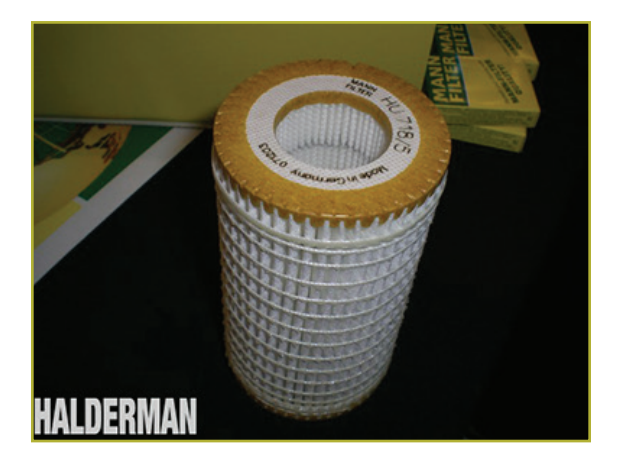
FIGURE 10—Cartridge Oil Filter