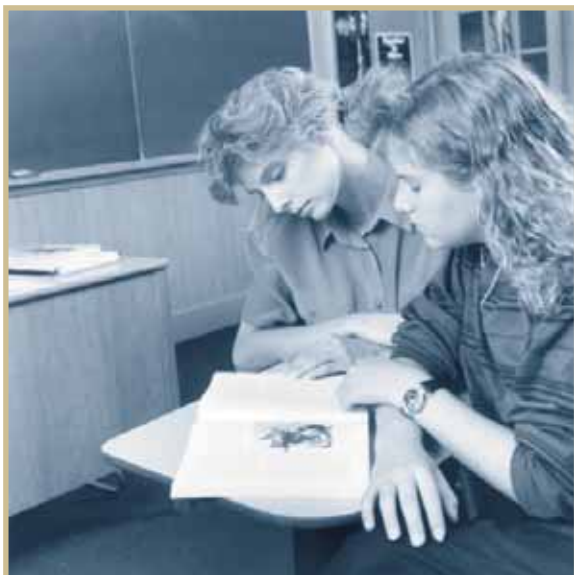
FIGURE 4—A teacher aide tutors a student in a one-on-one situation.

As a teacher aide, the teacher may direct you to tutor students in a one-on-one situation or in small groups. Tutoring will require a certain knowledge of reading, writing, and figuring mathematical calculations, depending on the subject matter. It will also require good communication and listening skills. Tutoring is important in giving students the attention they need to understand a subject and to improve their grades (Figure 4).