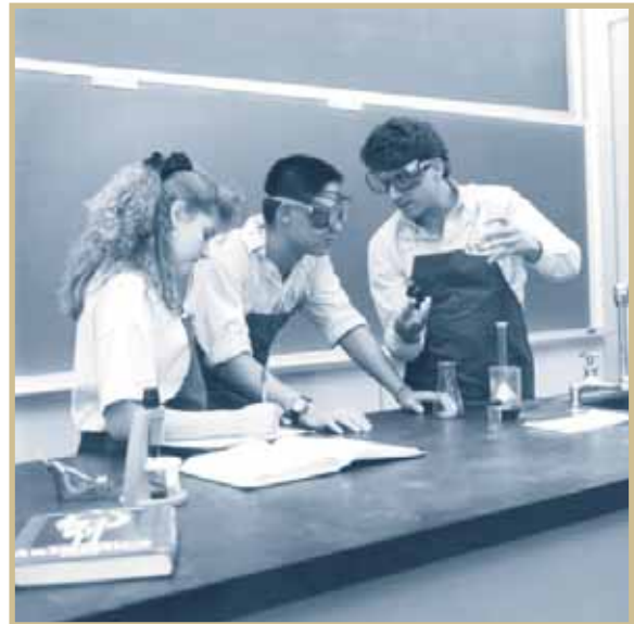
FIGURE 2—A teacher aide monitors the work of a small group.

Some teacher aides have skills and creative abilities, such as playing a musical instrument, calligraphy, embroidery, or woodworking. A teacher who doesn't have such skills may call upon the teacher aide to instruct the students in the skill or ability. Perhaps the teacher aide will teach the students a song. Or perhaps the aide will teach the students how to make a certain Mother's Day gift. Such added extras are important in providing the students with different enriching and educational experiences (Figure 3).