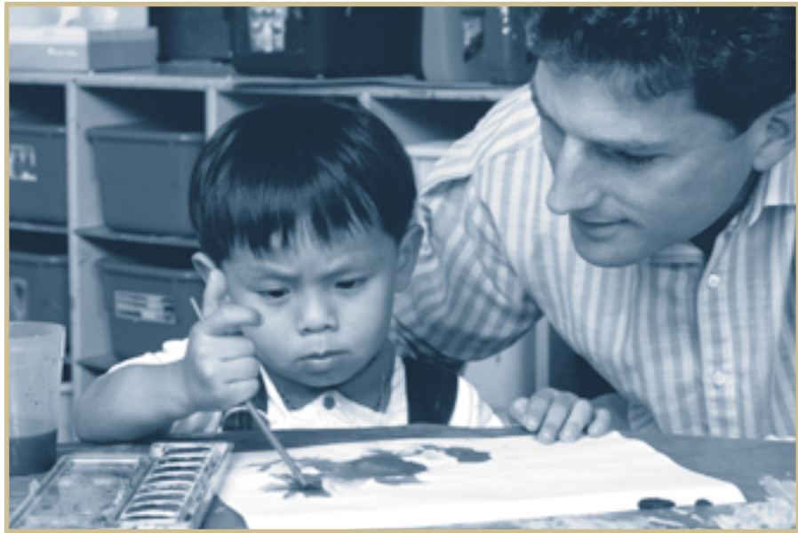
FIGURE 3—A teacher aide may guide students with painting.