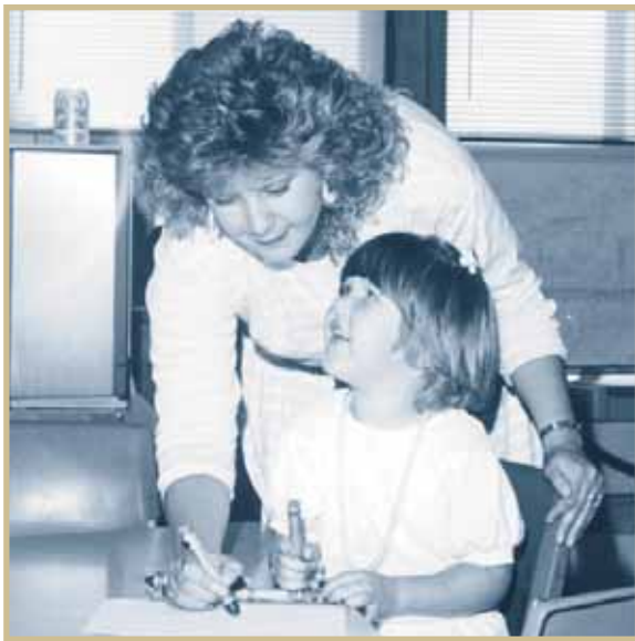
FIGURE 1—Whatever your reasons for becoming a teacher aide, you must enjoy working with children.

Let's begin by looking at some basic definitions. A teacher aide is someone who assists or gives aid to a teacher. Sometimes we call a teacher aide a teacher assistant . It's important not to mix up this term with an assistant or student teacher. An assistant or student teacher is a person who has taken a certain number of college credits toward becoming a licensed teacher. A teacher assistant, on the other hand, may have taken college classes and may or may not intend on becoming a teacher.