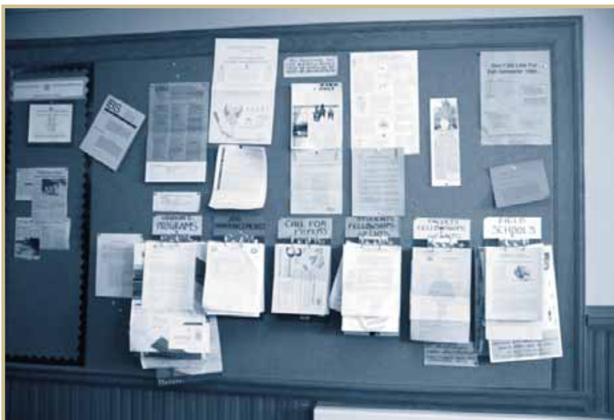
FIGURE 5—Teacher aides may take down materials from the bulletin boards and post something new.

While such clerical duties may not seem related to the primary purpose of the instructional aide, they're very important in aiding instruction. If a teacher can delegate clerical duties to a teacher aide, he or she has more time to spend actually teaching.