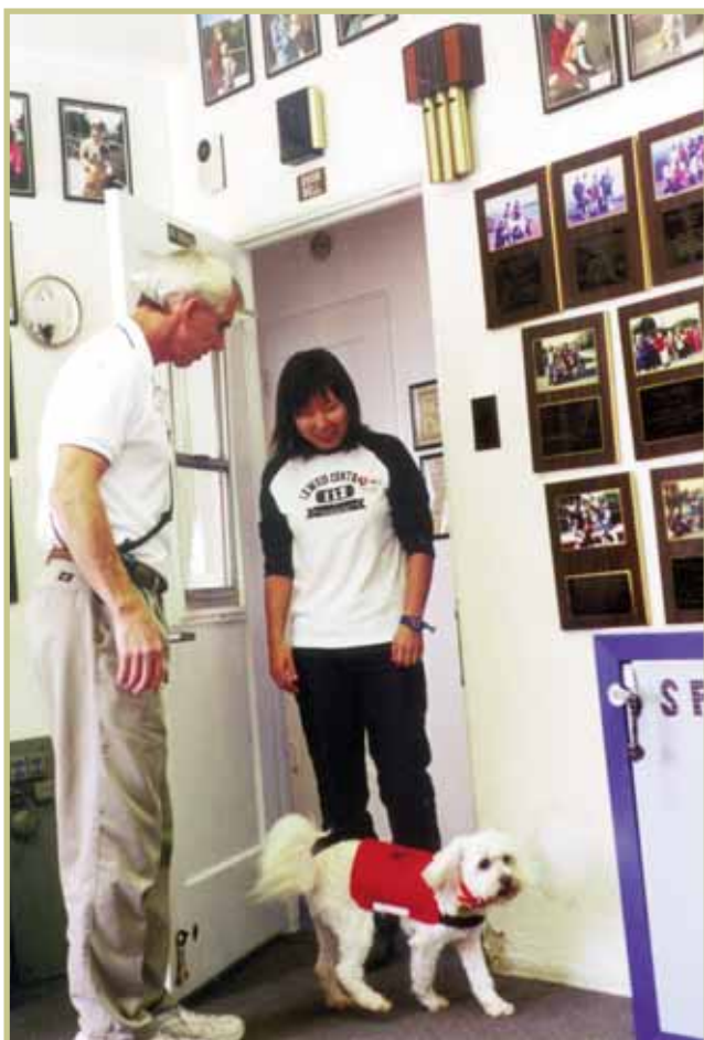
FIGURE 2 —Although you may never become involved in specialized fields such as service dog work, you should have a good understanding about what's involved in their training. It's also helpful to know the major organizations responsible for training and placing these dogs, such as the San Francisco SPCA Hearing Dog Program shown here.

You need the time and commitment to dedicate yourself to studying the material in this program. And, of course, you'll need to have a dog to work with. You don't necessarily need to own your own dog, however. You can use this opportunity to teach your sister's, grandmother's, or neighbor's dog some wonderfully useful stuff—like sitting politely when company comes and eliminating in an appropriate place. You might even contact your local animal shelter to borrow a dog. Training a shelter dog is a worthwhile endeavor, since it helps make the dog more adoptable.